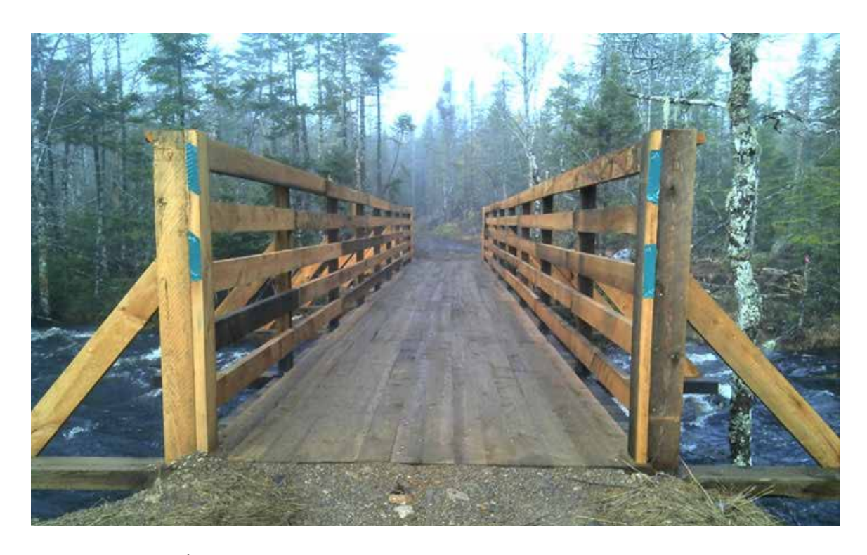
Heritage 150 Trail