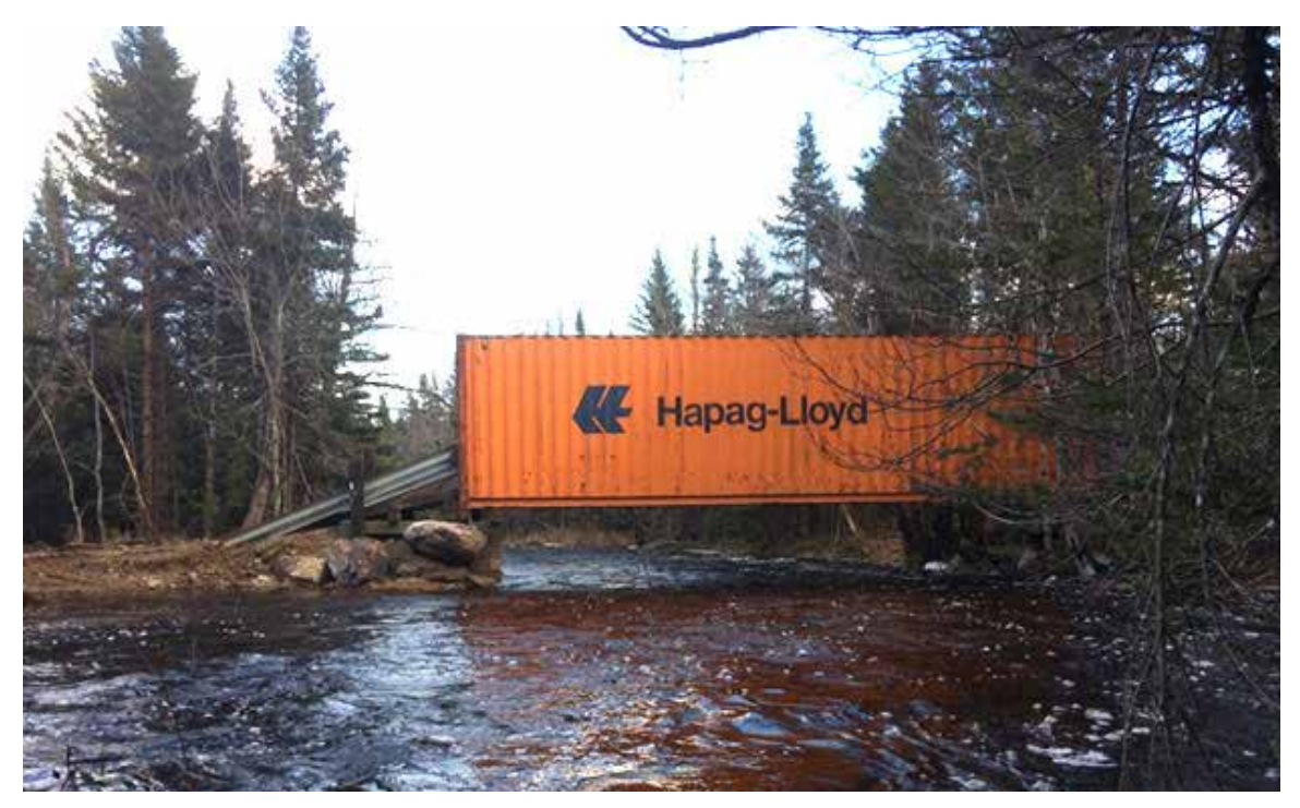
We will be running a rally across this bridge March 9, 2019 and hope to have a grand opening ceremony in April or early May.

The Sheet Harbour snowmobile and ATV club are close to completing what is, to us, a major undertaking. We Built a 1/2 km of trail and used a 40-foot sea container to create a covered bridge across the Quoddy River. We started raising money 3 years ago, and along with Small Grant money from the OHV fund, started construction early summer of 2018 and had the bridge in place and usable just before Christmas 2018. All that is left to do is install wooden guard rails and two posts in the frozen ground. We expect completion by early February, 2019.